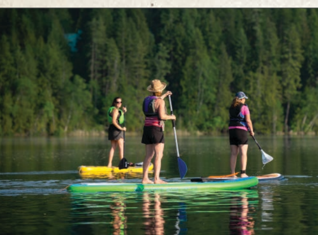
GARDOM LAKE

ACCESS: See Adams Lake. At the north end of Adams Lake take the Adams East Forest Service Rd to access Momich Lake Prov. Park. Visit www.BCParks.ca for more information.