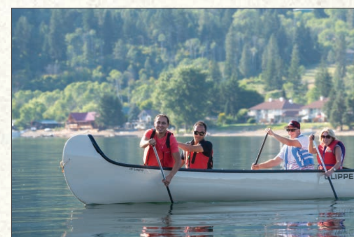
LITTLE SHUSWAP LAKE

12 FALKLAND AREA LAKES – several little lakes in the Falkland area are excellent for fishing, particularly from kayak, and make equally pleasant nature viewing paddle destinations to explore. a) Pillar Lake -recreation site, boat launch and camping; b) Joyce Lake - good camping at this regularly stocked fishing lake and recreation site; c) Bolean Lake – a popular fishing and recreation site; d) Spa Lake - part of the little cluster of lakes to explore off a spur of the Bolean Forest Service Rd in the Spa Hills area; e) Arthur Lake - accessed from the Bolean Forest Service Rd in the Spa Hills; f) Spanish Lake – a tiny but beautiful lake and recreation site set in a narrow valley bowl surrounded by forested hills. Access from Silvenail Rd near Falkland.