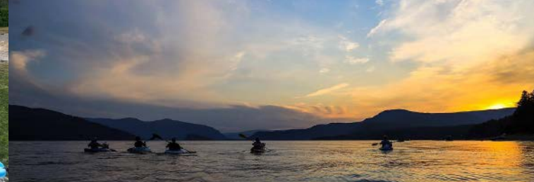
SHUSWAP LAKE