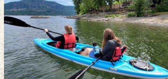
SHUSWAP LAKE

PADDLE TRAIL ONLINE LINK: shuswaptrails.ca