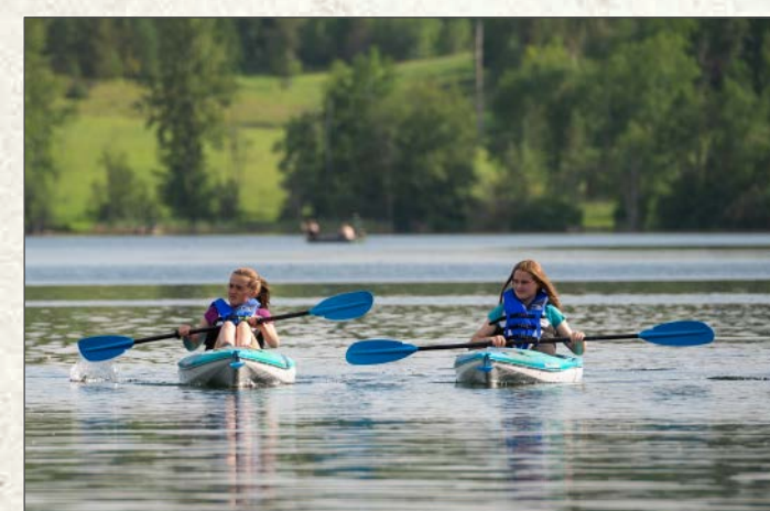
GARDOM LAKE

ACCESS: via boat at the north end of Anstey Arm on Shuswap Lake. Look for the portage trail sign on the west bank of the bay. Check with www.BCParks.ca for updates on wildfire closures.