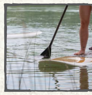
WHITE LAKE