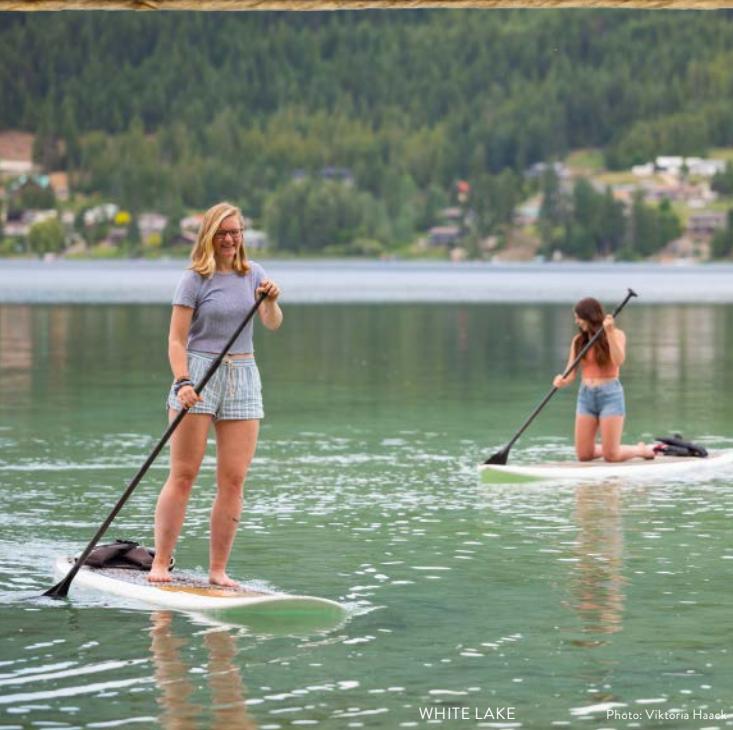
WHITE LAKE