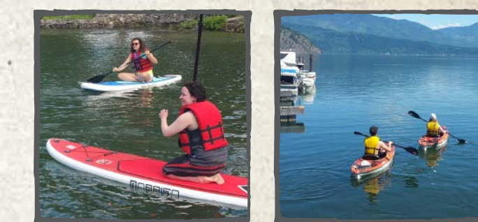
BLIND BAY

ACCESS: a) Kingsfisher Marina via the Mabel Lake Rd from Enderby; b) Noisy Creek Rec. Site on the northwest shore via the Three Valley Gap Forest Service Rd; c) Cottonwood Beach Rec. Site; d) Cascade Beach Rec. Site; or e) Mabel Lake Prov. Park via Cherryville from the south.