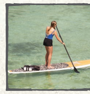
WHITE LAKE