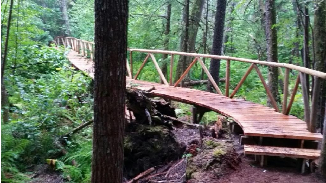
Photo: The new bog log crossing and viewing deck at North Fork Wild Conservation Park