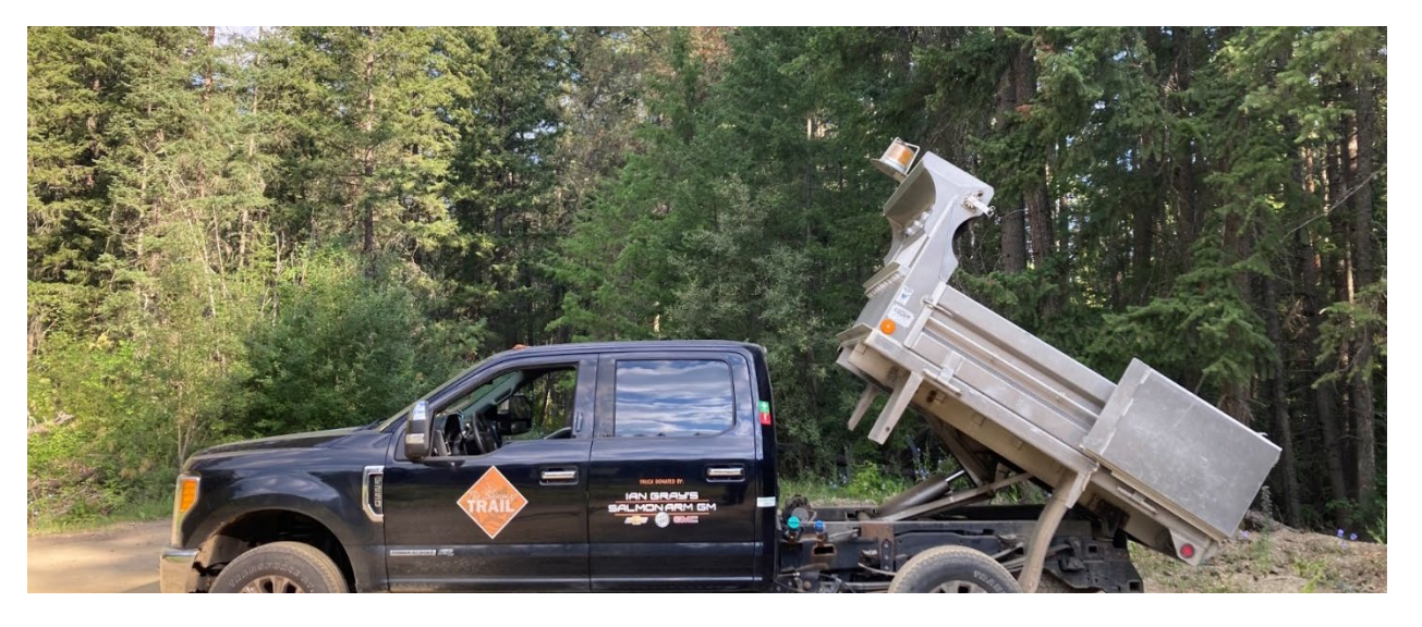
Ian Gray's Salmon Arm GM's 2022 Truck