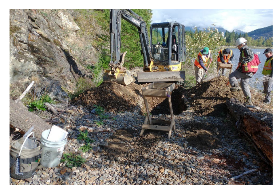
Mara Lake Section of Rail Trail – Geotechnical Test Pits and Archaeological Impact Assessments

In 2022 the Shuswap Trail Alliance again partnered with the Columbia Shuswap Invasive Species Society (CSISS) to mechanically remove Yellow Flag Iris at White Lake, Little White Lake, Gardom Lake and along the Turner Creek Trail.