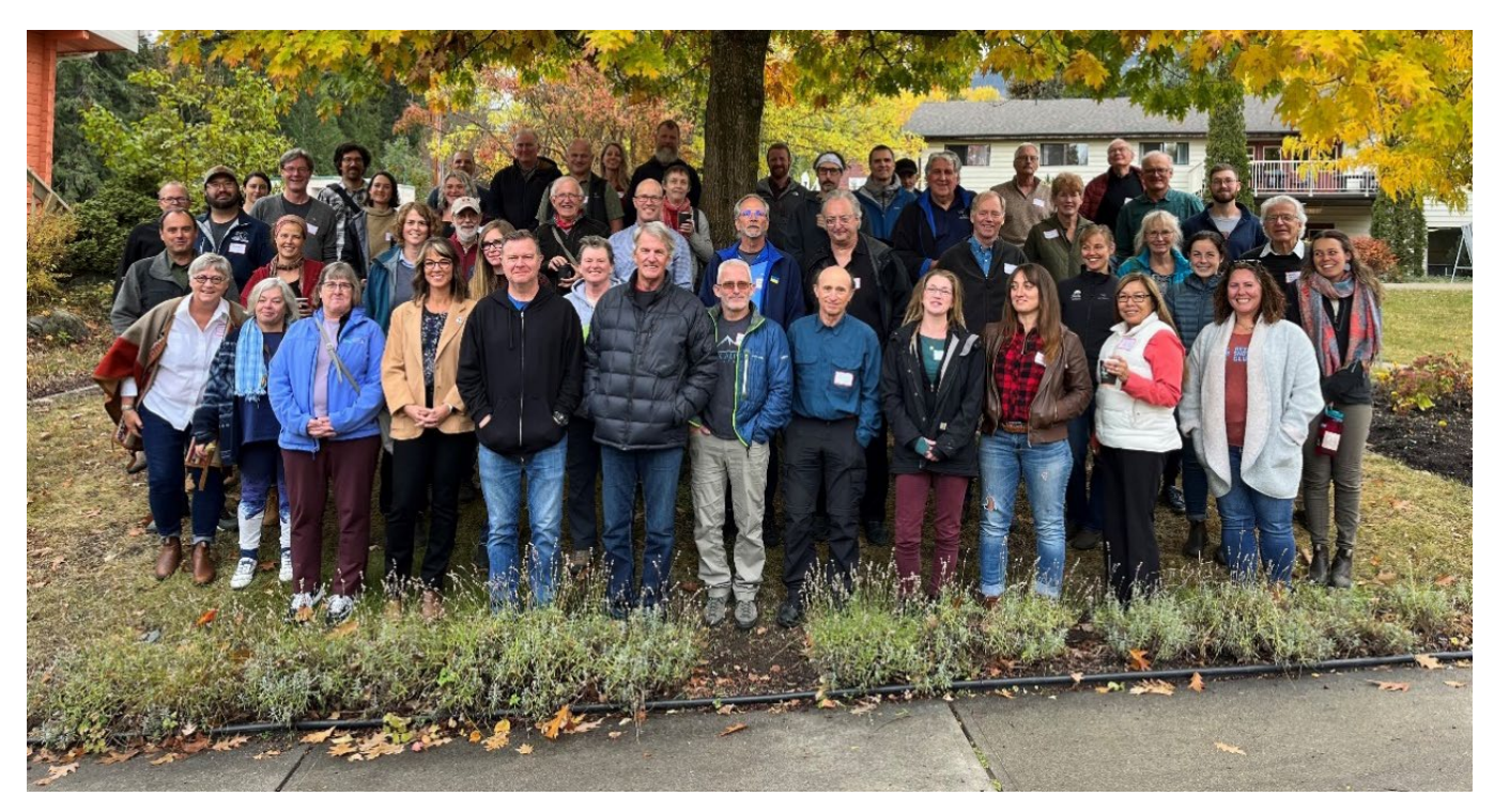
2022 Shuswap Trails Annual Roundtable - Sorrento Centre

The Roundtable is an example of how a collaborative approach can be used to plan, develop, and maintain recreational trails in a sustainable and effective way, while ensuring the participation and inclusion of all stakeholders. The Roundtable met in person in October, after several years of Zoom meetings. The Roundtable continues to meet annually in early winter and has a working group of leadership that meets quarterly. The Roundtable is made up of Indigenous, municipal, regional, and provincial government staff and elected officials, leadership from motorized and non-motorized recreation groups, Shuswap Tourism, Environmental Stewardship and Naturalist organizations, industry, business, public sector, Interior Health, School District 83 and many and more. Collaborative recreation access management working groups supported through the Roundtable include the South Canoe, Skimikin, Glenemma, South Shuswap Destination Trail Planning Framework, Salmon Arm Greenway Liaison Committee, Larch Hills Non-Winter, Joss Pass Mountain and the West Bay Connector Trail.