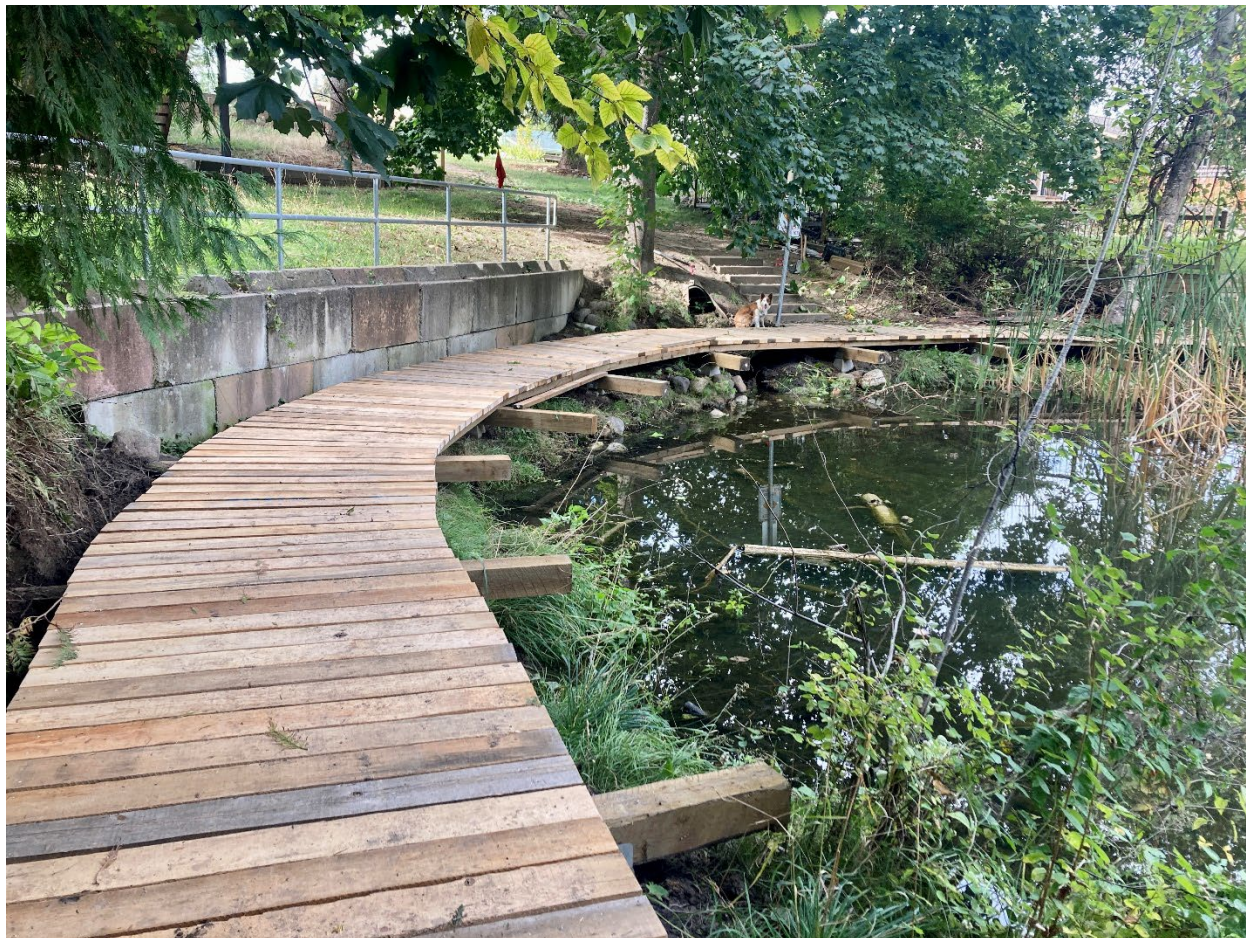
Turner Creek Trail