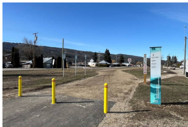
Shuswap North Okanagan Rail Trail Completed Section

Watch for updates and visit www.shuswapnorthokanaganrailtrail.ca for more information and to make donations.