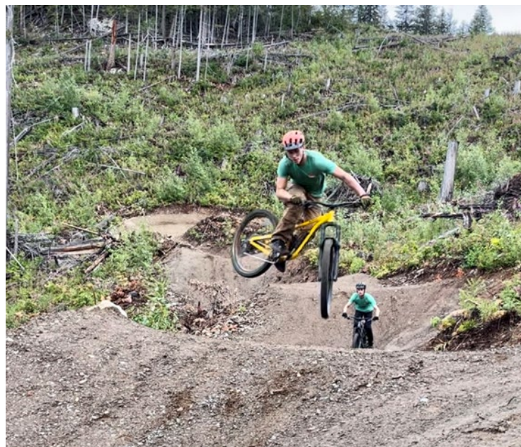
Rubberhead Jump Line

New infrastructure, in the way of power, was also installed at the South Canoe trailhead in partnership with the City of Salmon Arm and Tolko. This will enable events to occur at the trailhead without generators