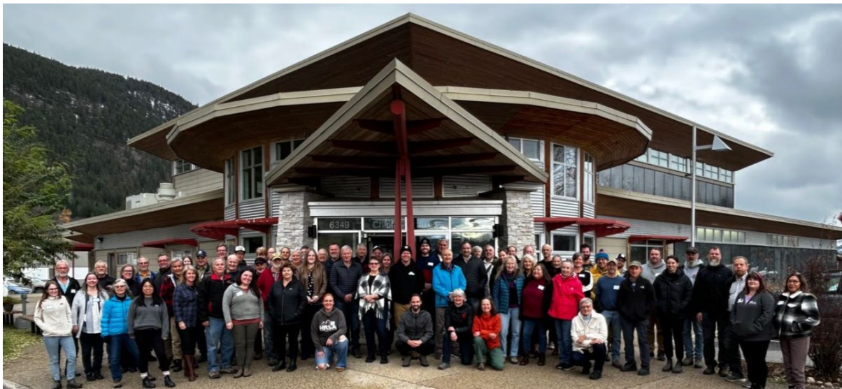
2024 Shuswap Trails Roundtable – Adams Lake Conference Centre

The Roundtable is an example of how a collaborative approach can be used to plan, develop, and maintain recreational trails in a sustainable and effective way, while ensuring the participation and inclusion of all stakeholders. The Roundtable again met in person in December at the Adams Lake Conference Centre. The Roundtable continues to meet annually in early winter and has a working group of leadership that meets quarterly. The Roundtable is made up of Indigenous, municipal, regional, and provincial government staff and elected officials, leadership from motorized and non-motorized recreation groups, Shuswap Tourism, Environmental Stewardship and Naturalist organizations, industry, business, public sector, Interior Health, School District 83 and many and more. Collaborative recreation access management working groups supported through the Roundtable include the South Canoe, Skimikin, Glenemma, South Shuswap Destination Trail Planning Framework, Salmon Arm Greenway Liaison Committee, Larch Hills Non-Winter, Joss Pass Mountain, Owlhead/Cummings/Blue Lake/Hunters Range, Kela7scen, and the West Bay Connector Trail.