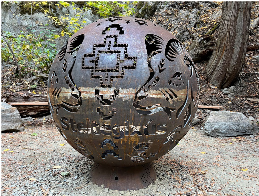
Secwépemc Landmarks Chase Creek Falls

Weytkp – you are in Secwépemc Territory. The Shuswap Trail Alliance exists as a collaboration of partners working together to create purpose-built, sanctioned, and sustainable trails throughout the Shuswap region. Our vision is Connected Trails, Healthy Communities and through thoughtful collaboration, we develop, operate, maintain, and promote non-motorized trails throughout the Shuswap. Our core values include Proactive Collaboration, Cultural Respect, Community Building, and Care for the Land. Each year, leadership partners throughout the region work together on diverse projects toward this vision leaning on the Shuswap Trail Alliance for support. It is a vision driven by values at the core of which is the idea of weaving it green (our communities and land) for generations to come in a spirit of respect, cooperation, and stewardship - often referred to as the Shuswap Trail Protocol. This protocol is based on the Secwépemc concept of Y'icwetsutce – taking care of the land – that forms the guiding foundation of the Shuswap Regional Trails Strategy.