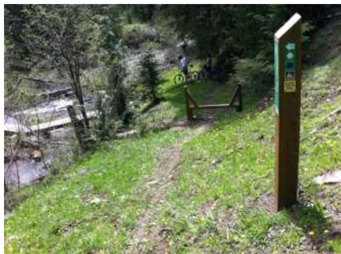
Type 3 6x6 trailhead post combined with en route sign