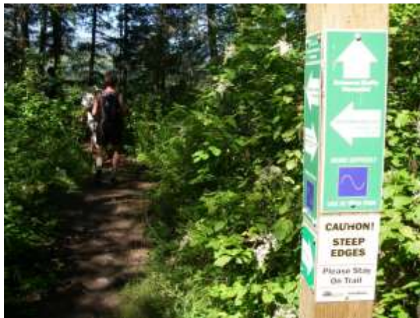
4x4 En Route Post – Balmoral Bluffs Trail System