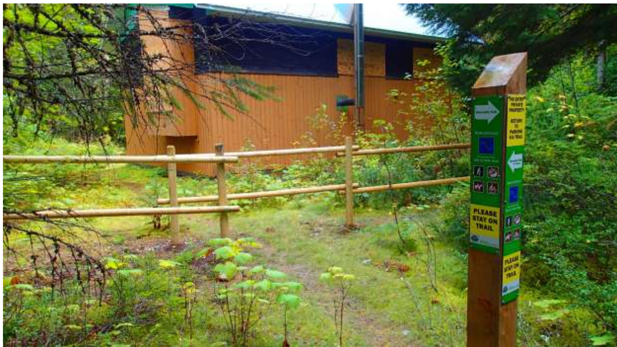
North Fork Wild