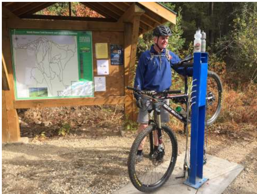
With the new bike repair stand sponsored by the Shuswap Bike Club.