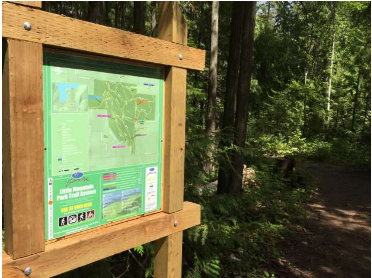
Type 2 Kiosk – Little Mountain Park Trail System