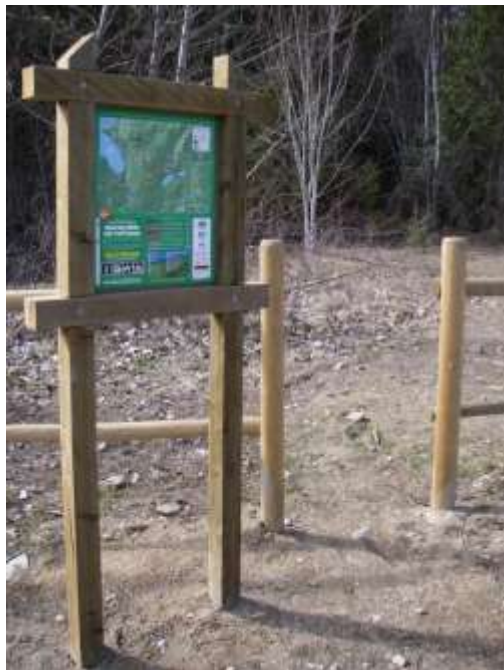
Type 2 Trailhead Kiosk (Smaller Alternate)