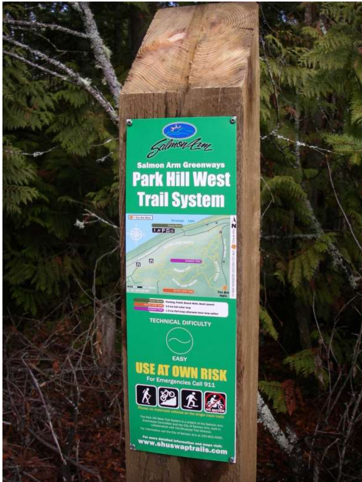
Type 3 6x6 Trailhead Sign