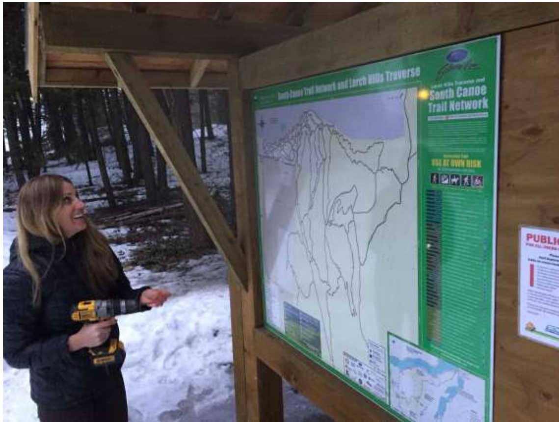
Type 1 Kiosk – South Canoe Trail System, Salmon Arm (Note: joint Provincial Rec Sites & City of Salmon Arm logos along top banner)