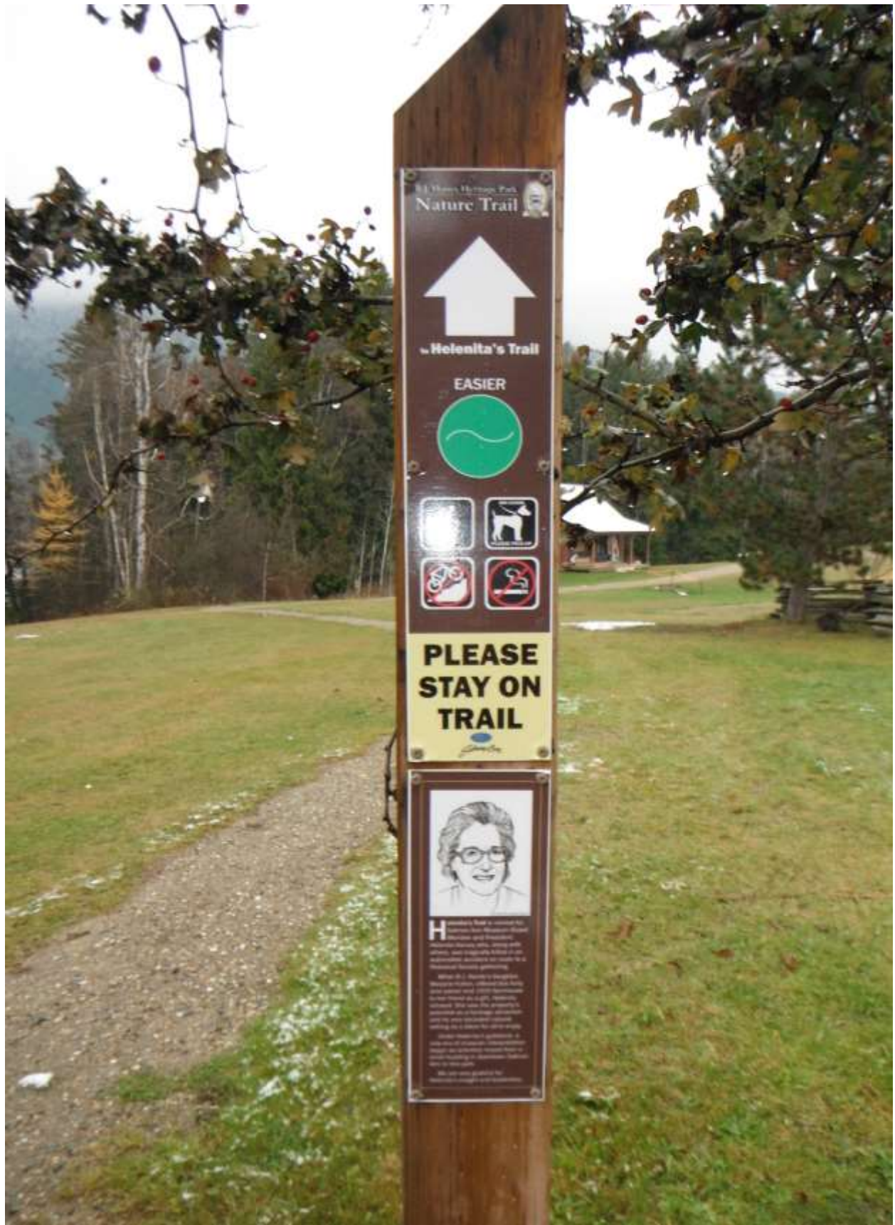
R.J. Haney Heritage Park – En Route 4x4 trail signs adapted to fit Haney Village colour scheme, including interpretive dedication