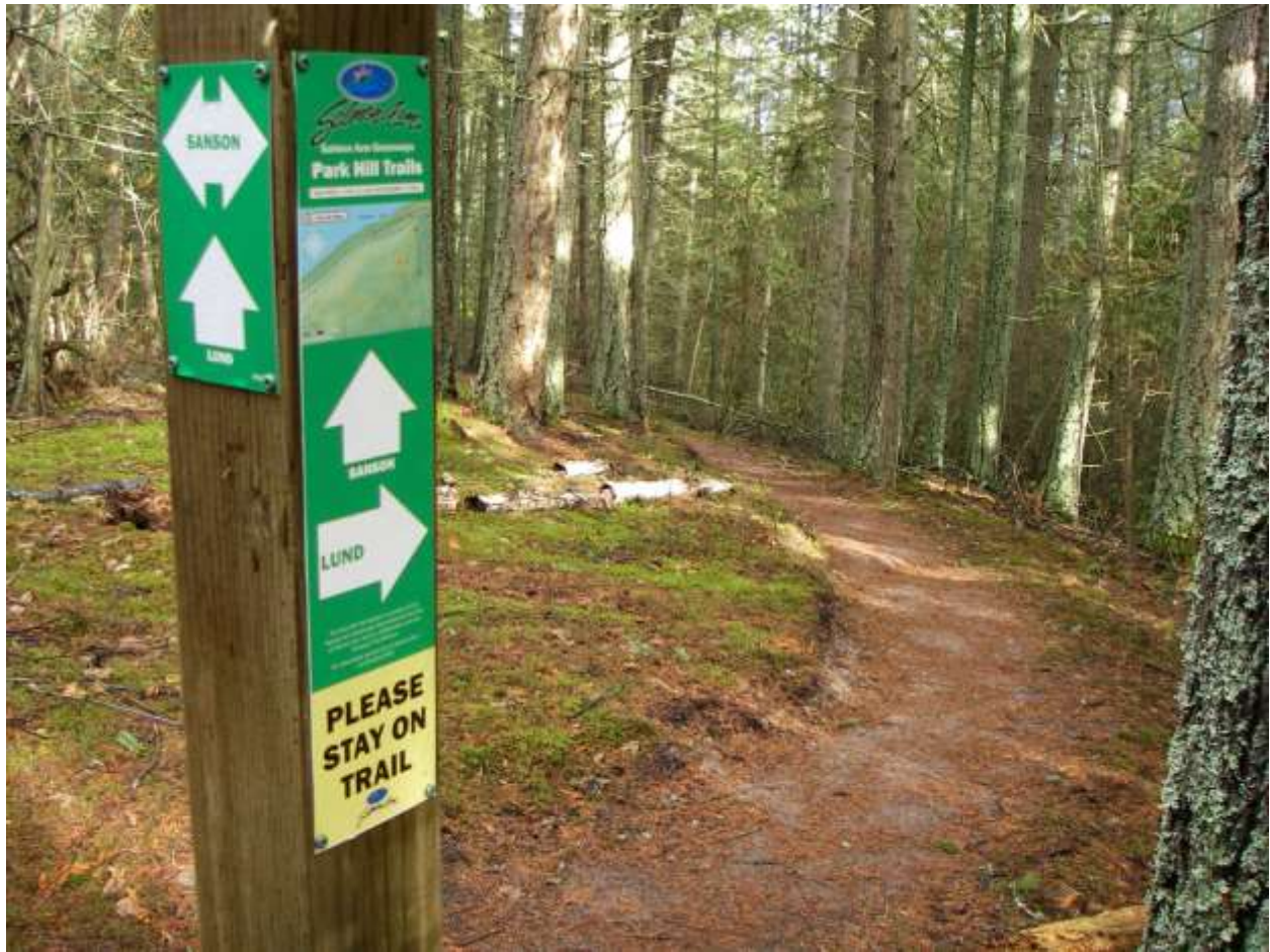
En Route 4x4 Trail Sign