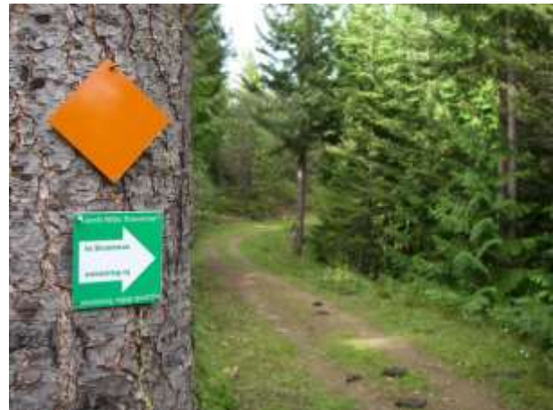
Direction Blaze Combo – Larch Hills Traverse