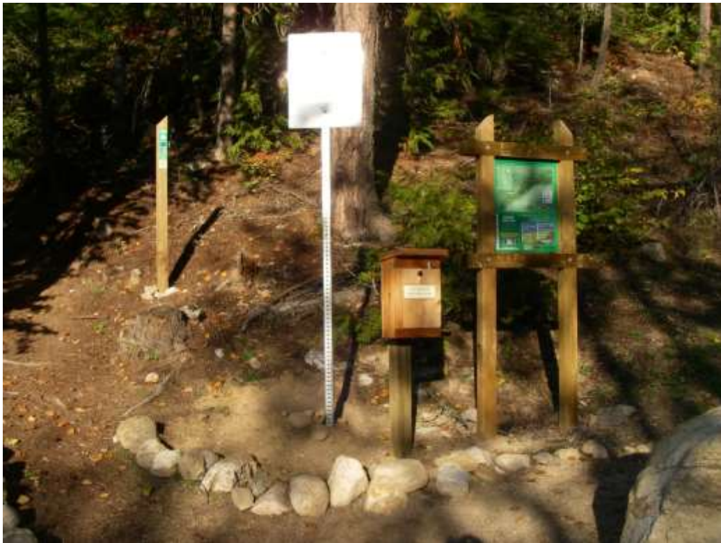
Type 2 Trailhead Sign with register box (note en route 4x4 post in background to left)