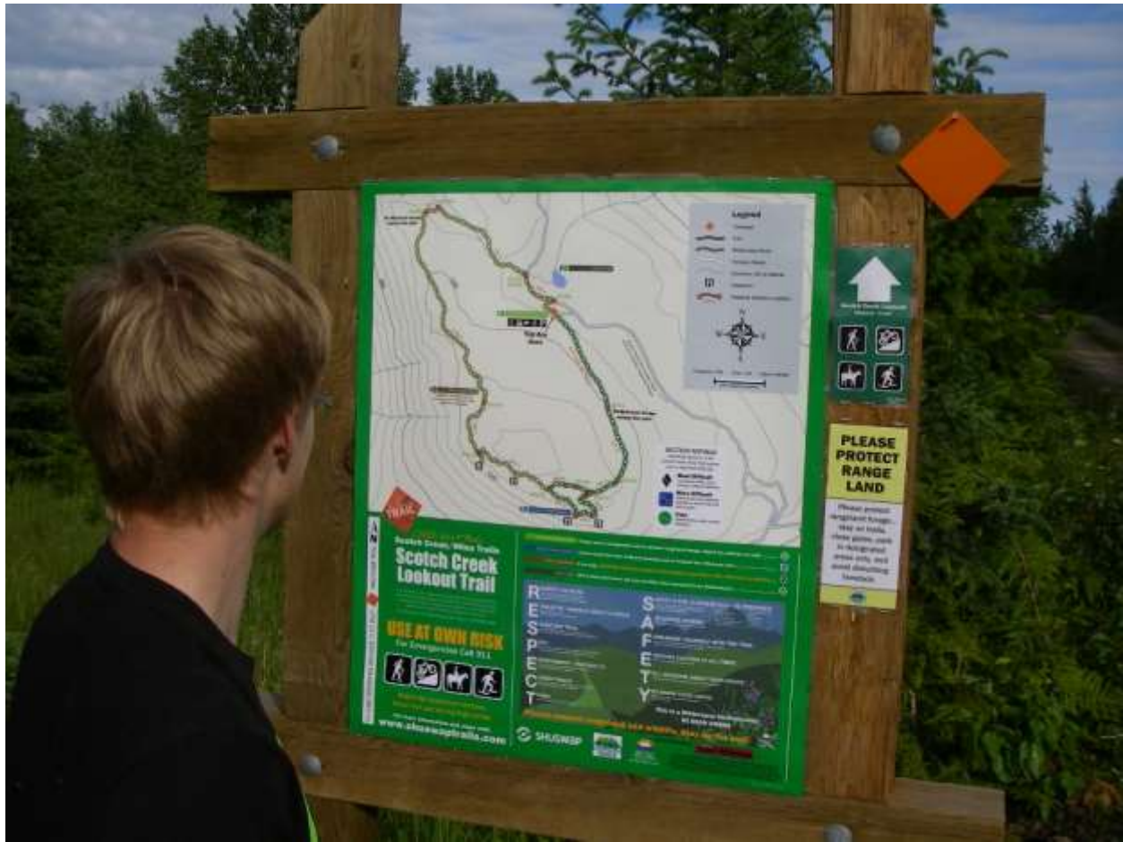
Type 2 Sign at Scotch Creek Hlina Lookout Trailhead – note new map colour and partner logos at bottom