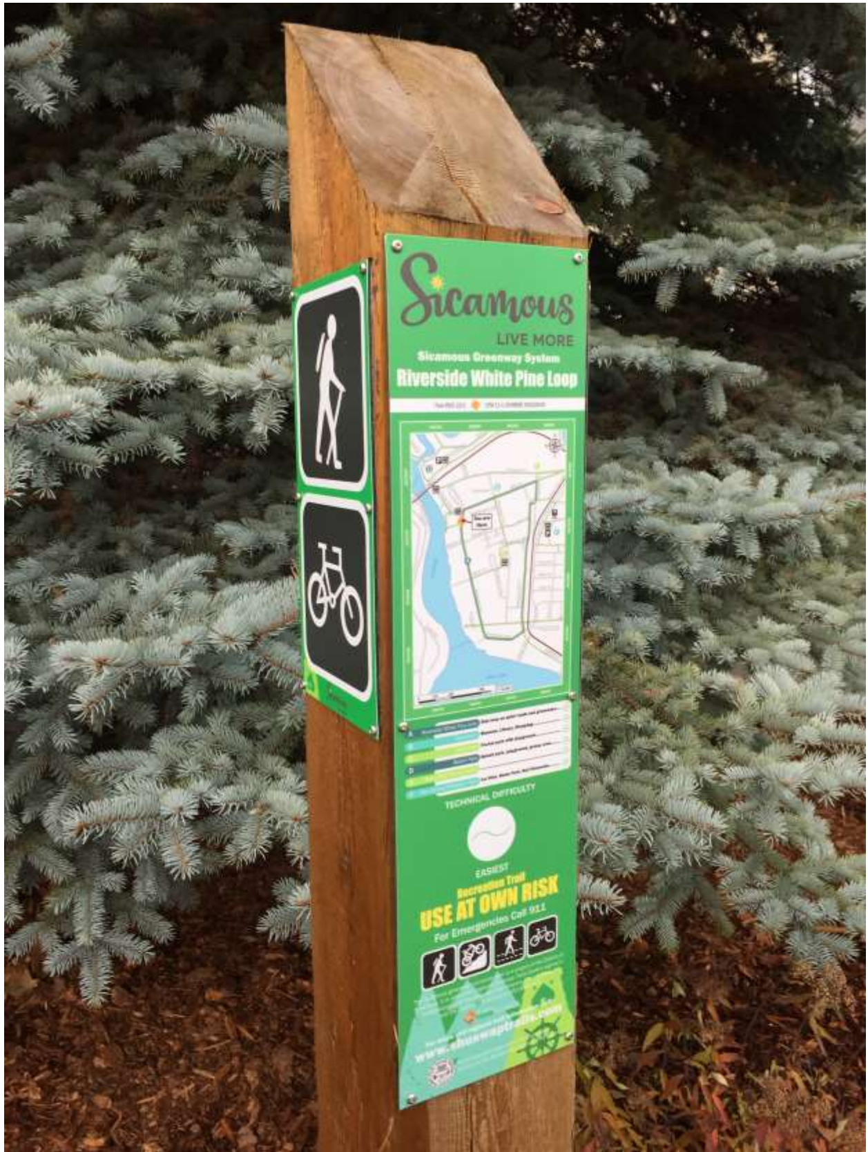
Type 3 Sign – adapted to incorporate the new District of Sicamous Branding