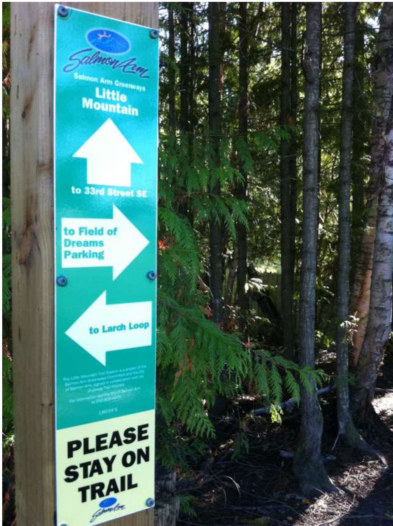
4x4 En Route Post – Little Mountain Park Trail System