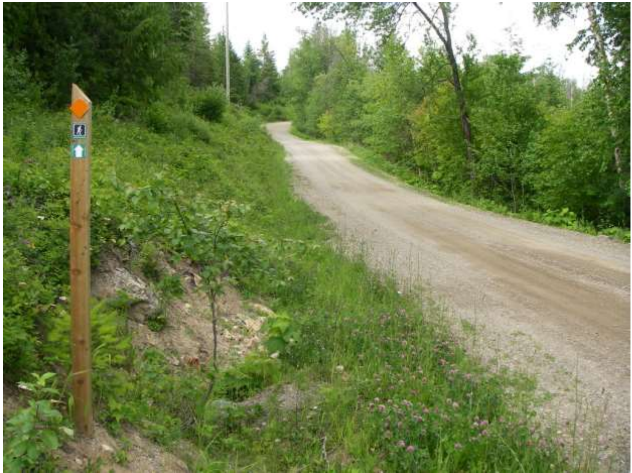
Simple road markers pointing way to trailhead – Scotch Creek Hlina Trail