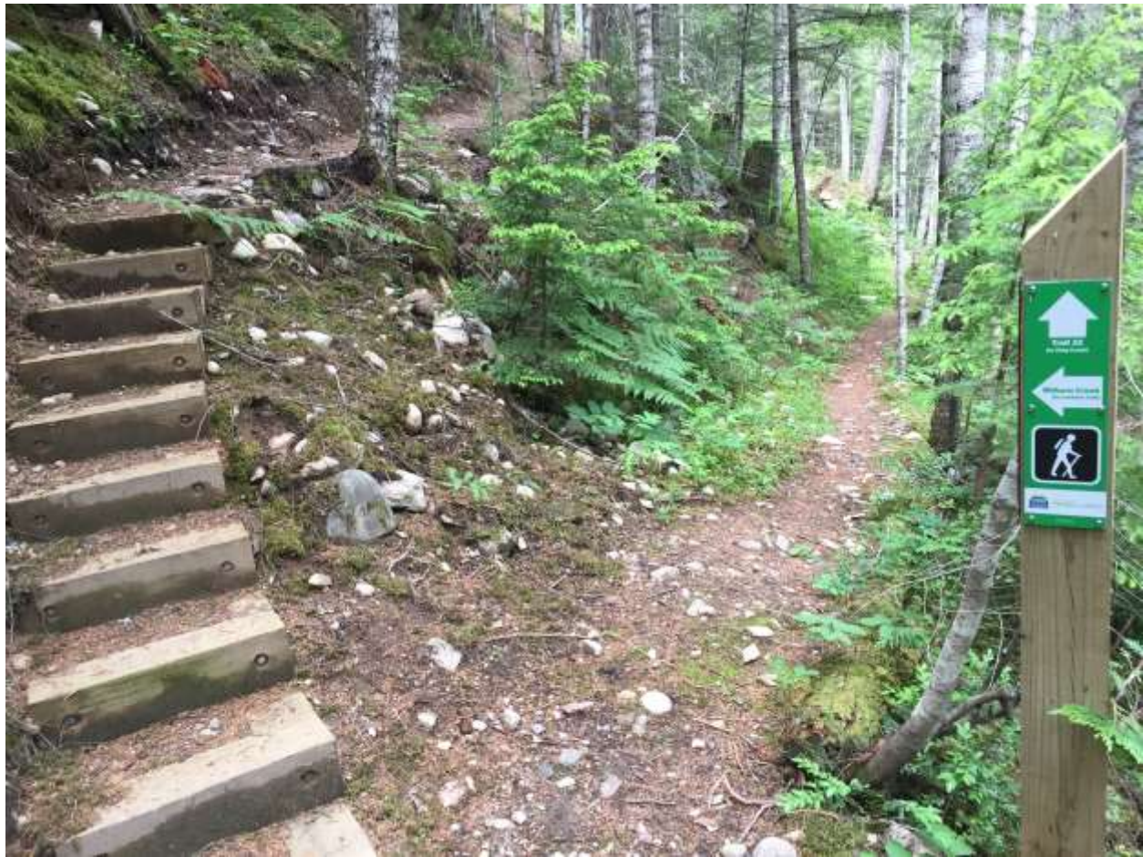
4x4 En Route Trail Sign at North Fork Wild Conservation Park (CSRD Area E)