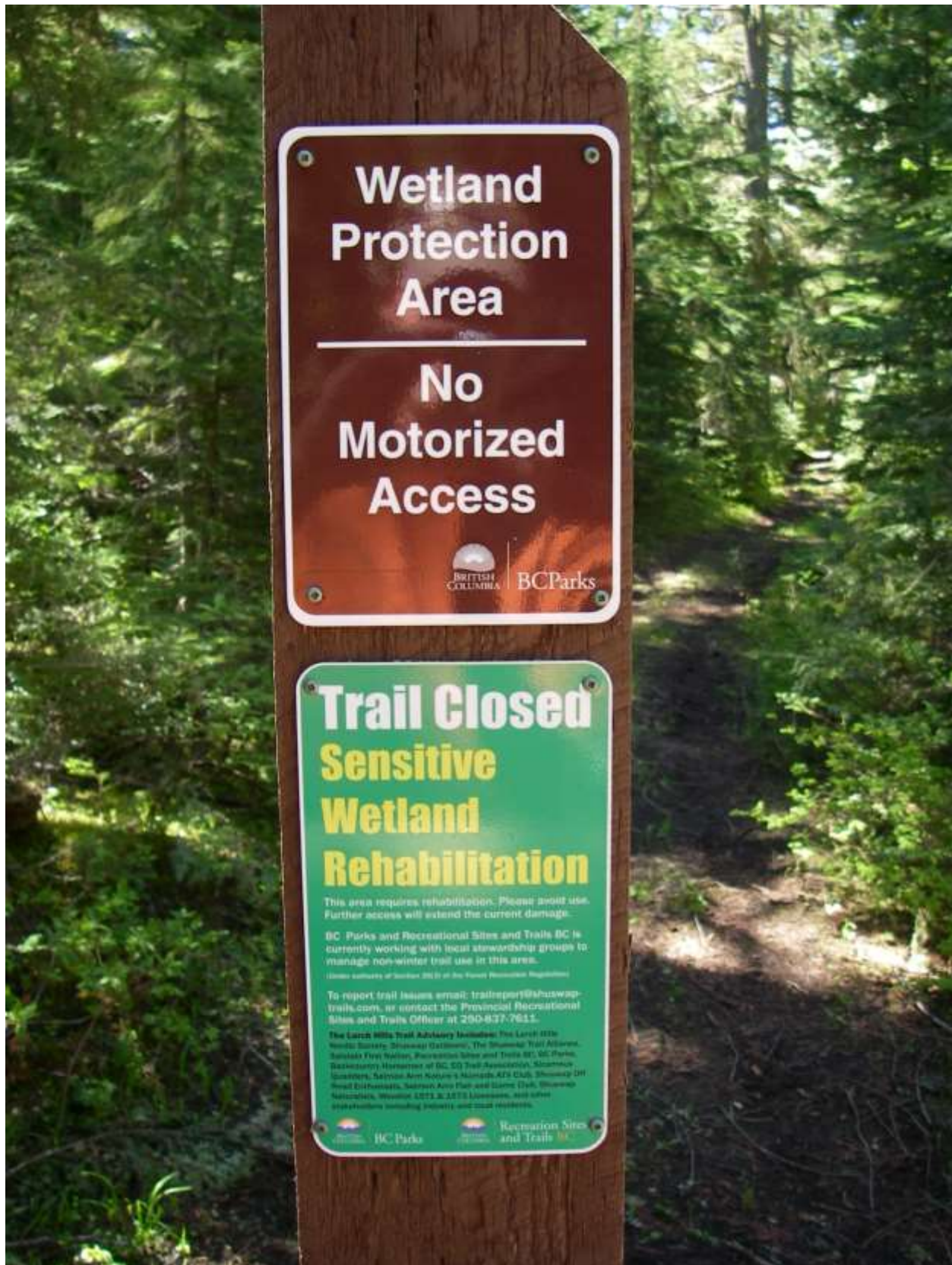
6x6 Trail Restriction Notice – Larch Hills Trail System