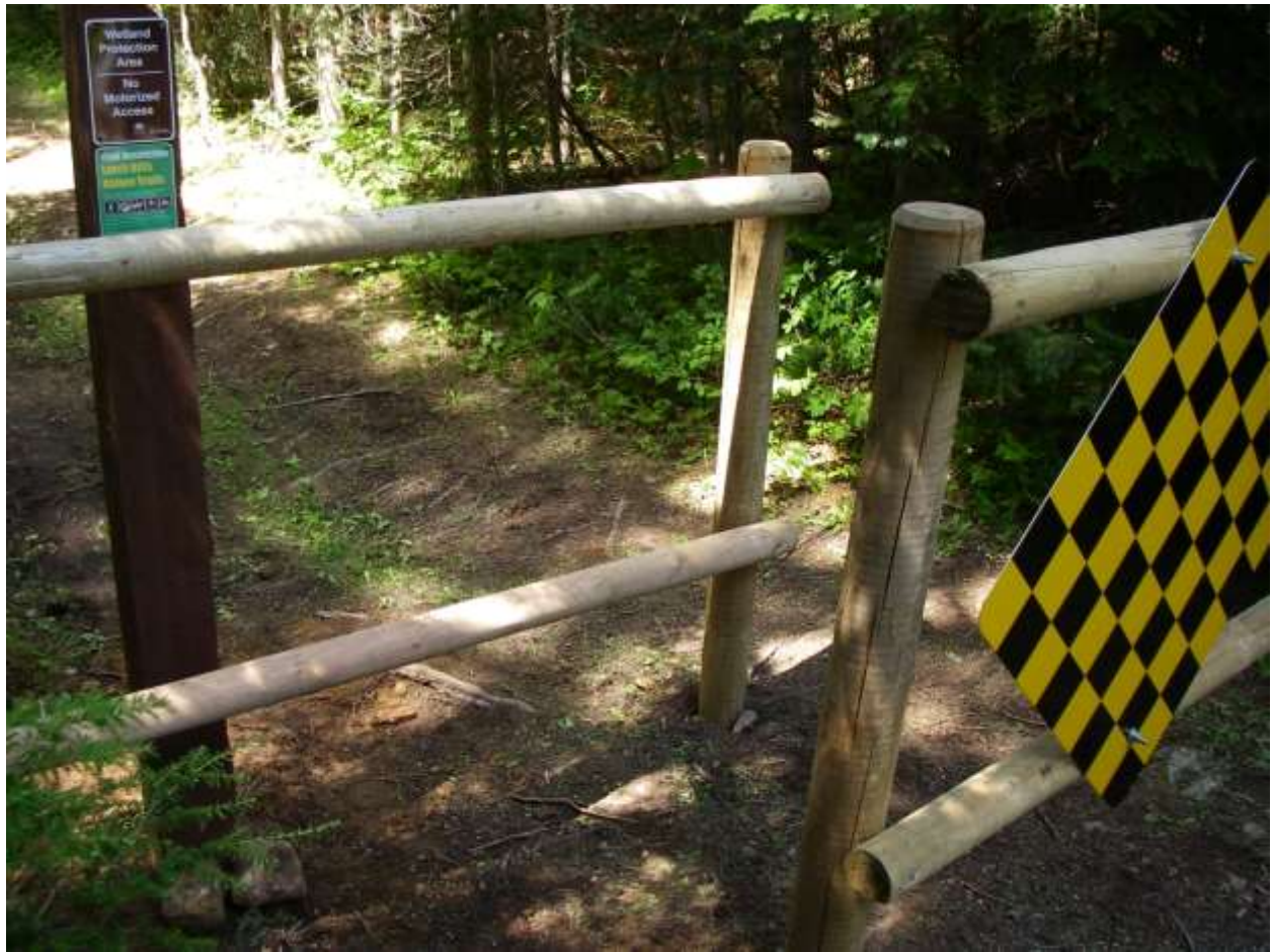
6x6 Trail Restriction Info – Larch Hills Trails – Note BC Parks Protection Sign at top