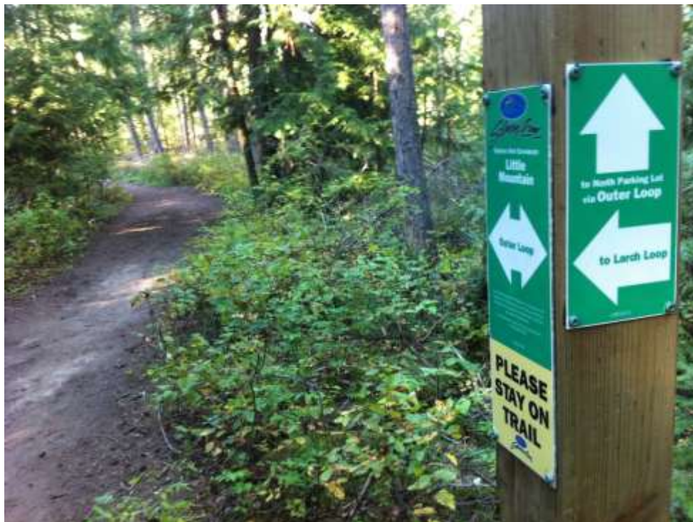
4x4 En Route Post – Little Mountain Park Trail System