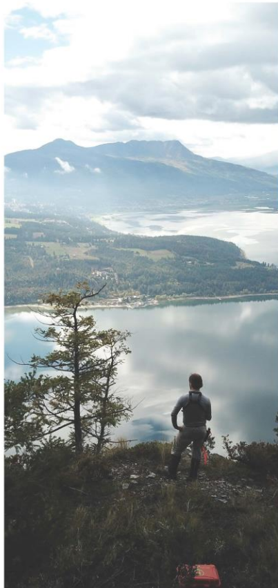
Recon on Bastion Mountain