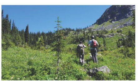
Twin Lakes Trail, Eagle Pass