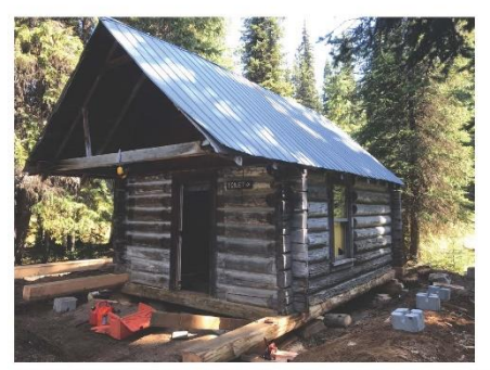
Owlhead Cache Cabin