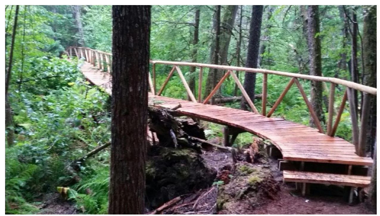
Photo: The new bog log crossing and viewing deck at North Fork Wild Conservation Park