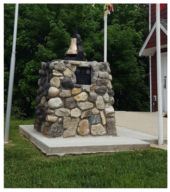
Monument @ Chase Museum