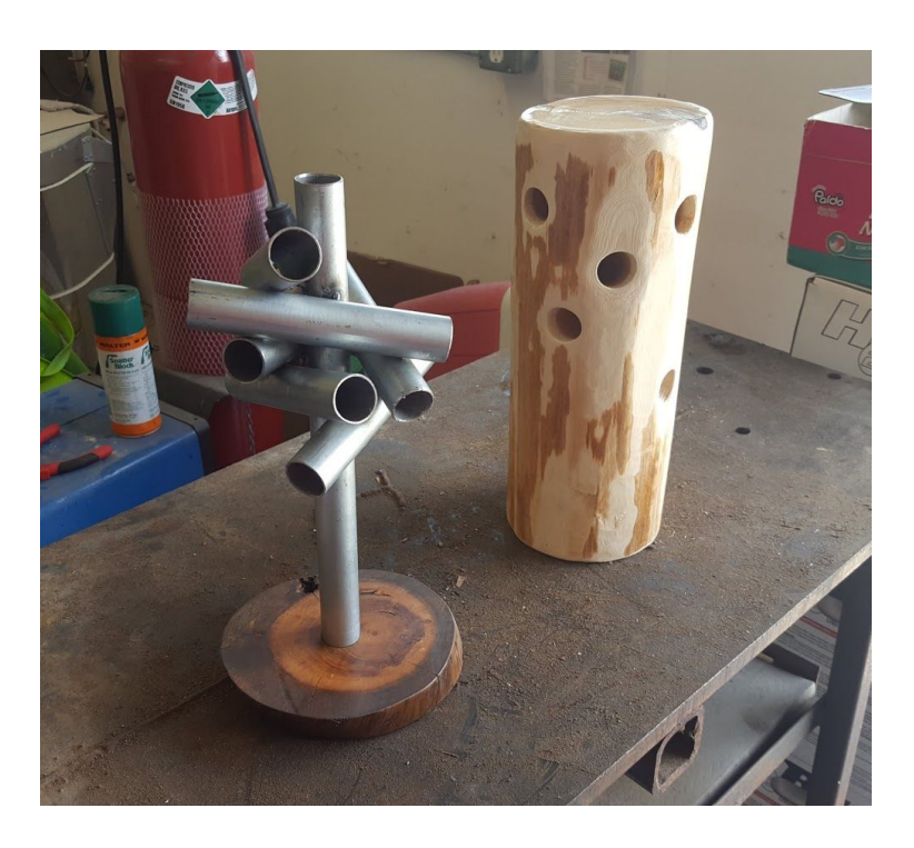
Table top examples of Secwepemc Landmarks displaying the functionality on the concept. Left, an example of what is used in Switzerland, Right, an example of a stylized version which enhances available space for pictograms and storytelling.